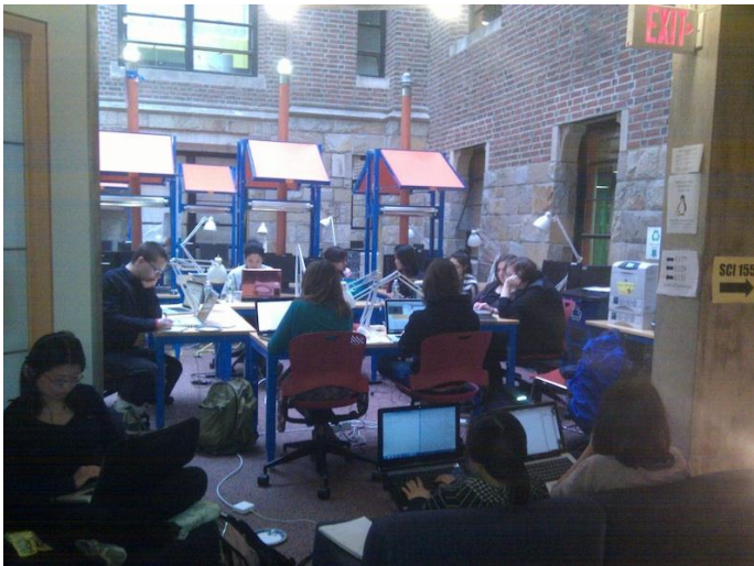
Students in CS349A participating in a Hackathon