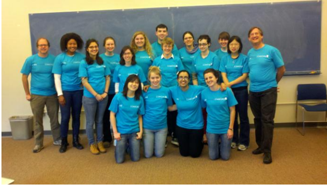
Students from the CS342 Computer Security class that competed in a Capture-the-Flag contest at MIT