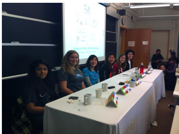
"Projects, Parks, and Perspectives Panel", Tanner Conference