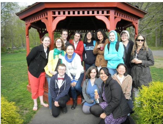
Getting ice cream on an outing at CCSCNE'12

A large group of students and faculty attended the 17th Annual Consortium for Computing Sciences in Colleges Northeastern Conference at Quinnipiac College in April: