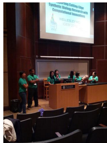
Wellesley iGEM team competing at the North American East Regional Jamboree