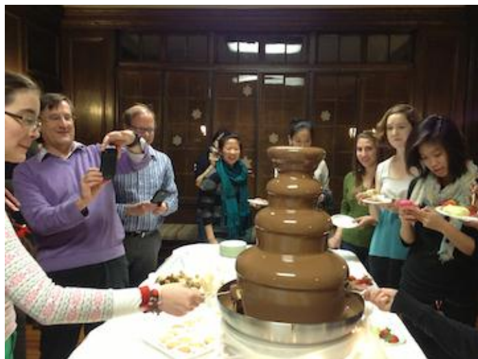
Chocolate fountain at the CS/MAS party

In December, we had our annual holiday get-together at Slater House. The featured attraction was a chocolate fountain, which was enjoyed by the large turn out of CS/MAS students, faculty, staff, and guests.